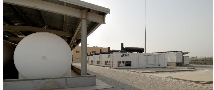
Pic. 5: 120,000-litre diesel tanks

This sound suggestion is a good example of the wide experience and expertise of KOHLER-SDMO in supplying generating sets to cargo ports. The added value of KOHLER-SDMO which has already benefited numerous port developments around the world, and which has provided full satisfaction during this project to the Djibouti port authority and China Merchants Holdings International.