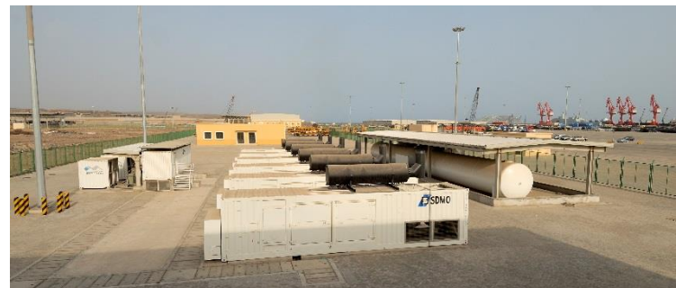
Pic. 3: The completed power plant at the Doraleh site. In the background are the port's cranes.

The output of the generating sets was also defined to be able to adapt to the hot/cold climatic constraints in Djibouti. The power plant is able to operate in an optimum manner without load loss at up to 48°C.