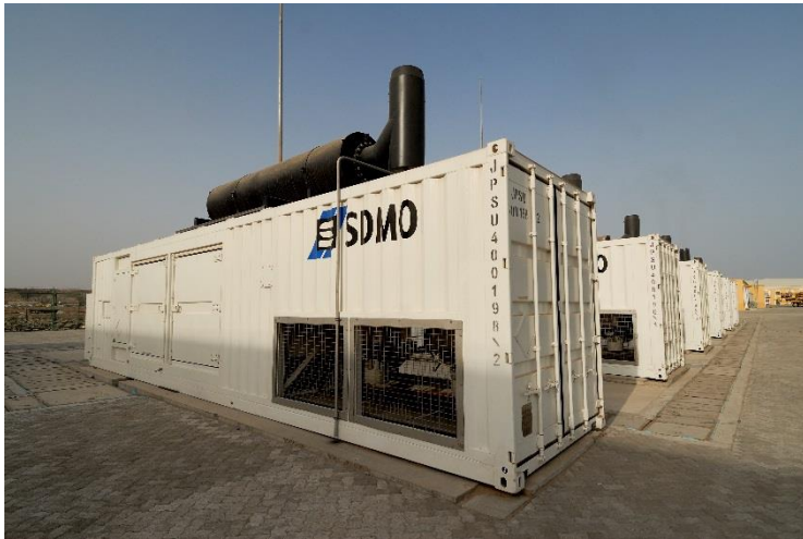
Pic. 4: Generating sets in CPU40 containers