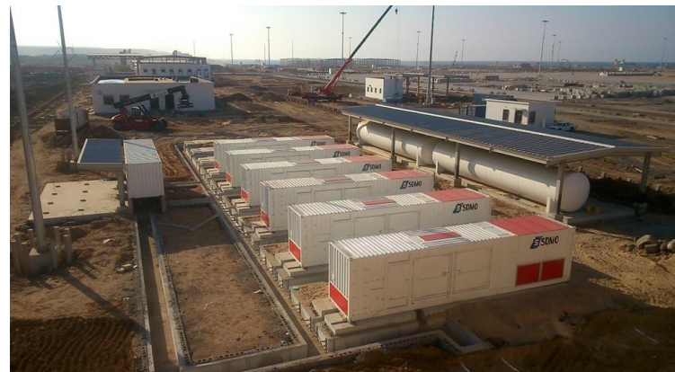
Pic. 2: The power plant during installation on site

The 6 x 2,000 kVA generating sets are housed in CPU40 containers. They are coupled together in series and will supply power to the port and its cranes in the event of a mains outage. The power plant is supplemented by 3 x 120,000 litre diesel tanks and a high-voltage equipment room. If the port is extended in the future, additional connections have been built into the design to be able to receive a further three generating sets.