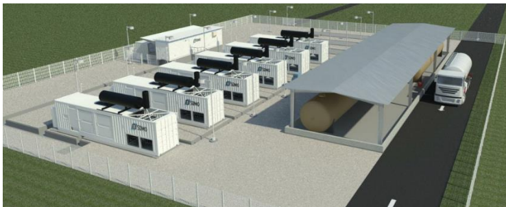
Pic. 1: 3D pre-project representation of the power plant

- A turnkey solution: from the pre-project phase through to site visit, installation and commissioning, KOHLER-SDMO personnel provided the client with support and a turnkey solution adapted to the specific features of the environment.